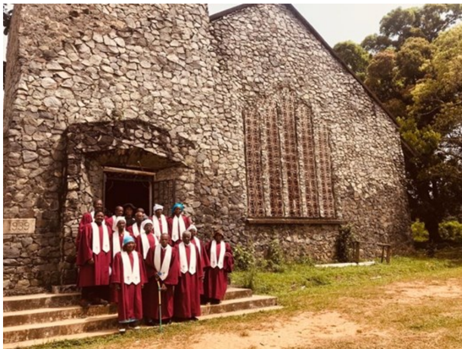
Cameroon Africa, Efulan Presbyterian Church Wearing First Presbyterian Choir Robes