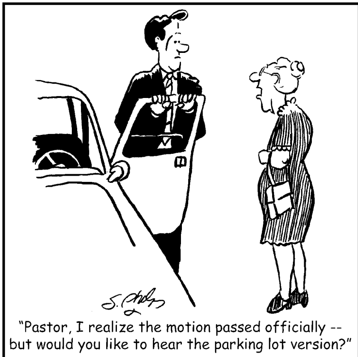
"Pastor, I realize the motion passed officially -- but would you like to hear the parking lot version?"